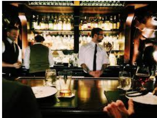
Bar Night Club